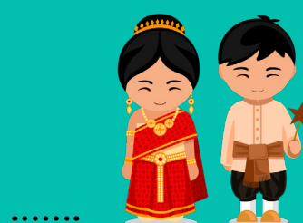
Thai royally bestowed